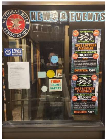
Stop here to catch-up on what is happening at your Club